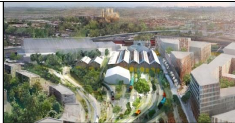
Construction & Infrastructure (including rail)