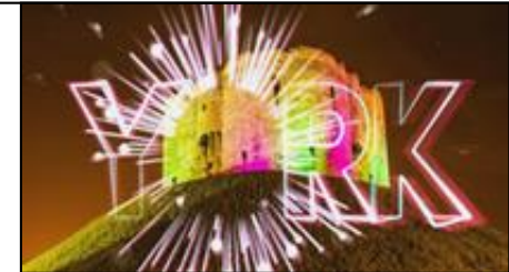
Hospitality & Tourism