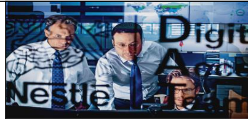
Digital, IT & Technology