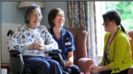
Health & Care

Harnessing the employment and career opportunities across all sectors for the benefit of all residents, with an immediate focus on